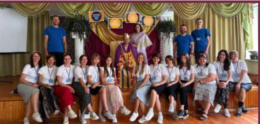
The theme of the children's camps in the Carpathian region was focused on the story of Esther. As you can tell from this picture, the help that they have received at the camps for group leaders etc are mostly young ladies, very few men available for this work.