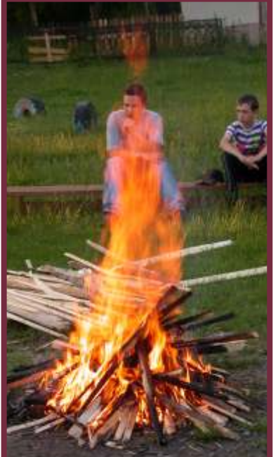
Some of the most memorable sharing and teaching happens around the campfires at the end of each day.

funding request or need for anything, the Lord has seen fit to get the funds into our account that we have been able to assist and meet the needs that were presented to us. It is for this reason that we have committed to assist with all of the camp requests that we have received... now we trust that God will see fit to work through you all as God's servants, in helping us meet our commitments. The total amount for these requests total around $65,000 CAD depending on the exchange rate from Euros. This sounds like a large amount but keep in mind that this is going to send 2500+ children to camps. Through some very simple math it is easy to figure out that this averages out to $25.87 to send a child to camp. If this is a project that you would like to assist us with please send your donations marked for "Children's Camp". Thank you for your help in changing these lives."