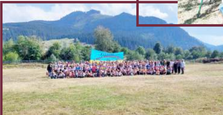
The final day of a 5 day camp in Yablunytsya saw more than 150 parents come to hear the preaching of God's Word.