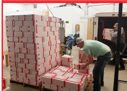
Unloading Gift Boxes from Taber, Alberta

Earlier this year we had set our Gift Box goal at 2,500 boxes for this Christmas. We were already dealing with the Covid-19 pandemic at that time but we thought that it would be over by the time we started to ship out our Gift Boxes. With all the restrictions that are imposed throughout the country, it's only by God's grace and mercy that we have been able to meet that goal and even exceed it.