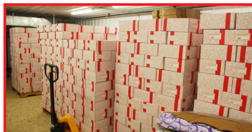
Another 1650 Gift Boxes ready to ship.

“Glory to God in the Highest, and on earth peace, good will toward men....” (Luke 2:14)