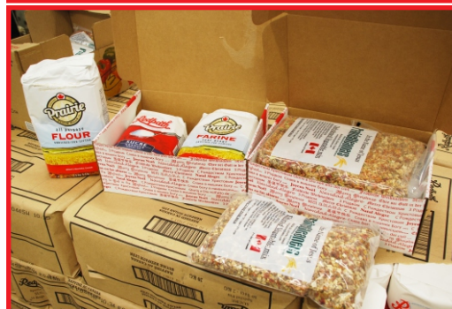
Our new "Grocery Gift Box" Flour, Sugar and Gleaner's Soup Mix