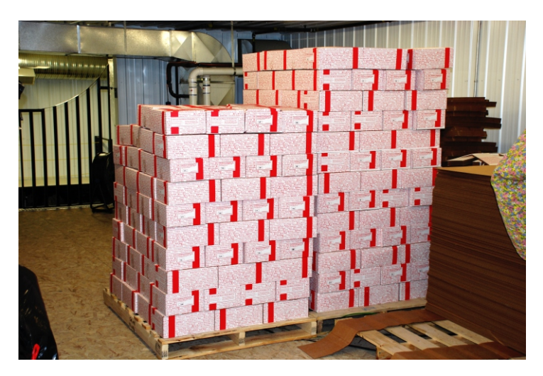
* Here is a list of items that we recommend you put into a gift box:

PLEASE NOTE: The red & white Faith Mission Gift Boxes are for Faith Mission use only. Please don't use these for supporting other ministries and please don't bring us boxes that have been made for other ministries.