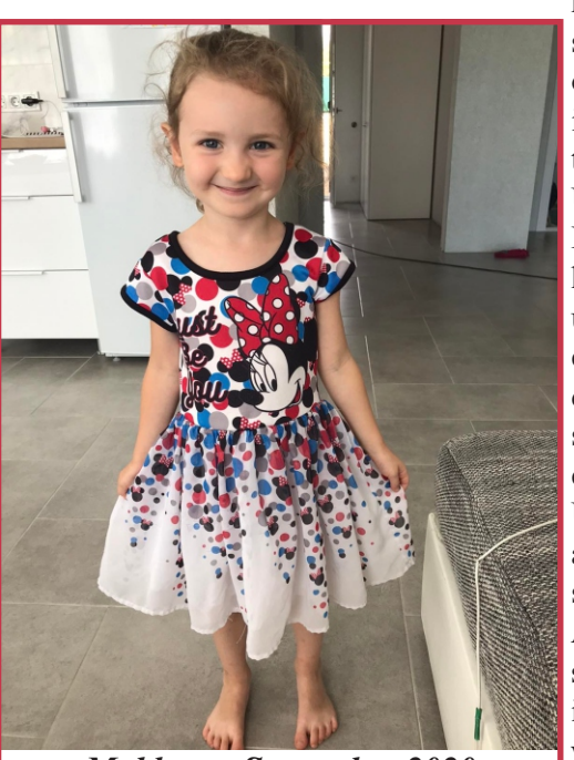
Moldova - September 2020

The Covid-19 pandemic has affected the entire world and has taken the lives of more than one million people around the world since the beginning of the year, In spite of all this, Faith Mission