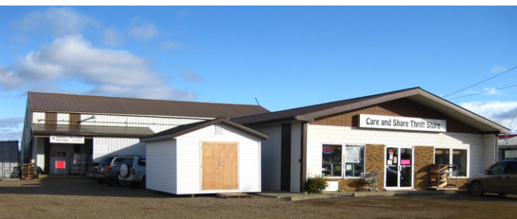
La Crete, Alberta - Care & Share Thrift Store Collection, Sorting, Baling - Shipping to Winkler, MB

Historical Mennonite home and the famous 800 year old Oak Tree, we visited on our 2008 trip to Ukraine.