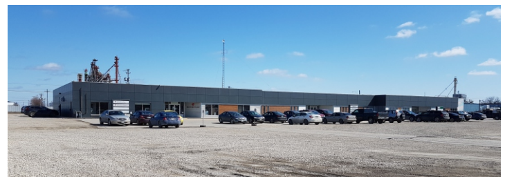
Move to Main Plaza Main Street - Winkler, MB - Feb.1996