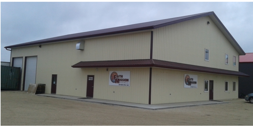
2014 Built a new Faith Mission Warehouse / Office Building on 425 Roblin Blvd East - Moved in March 2015