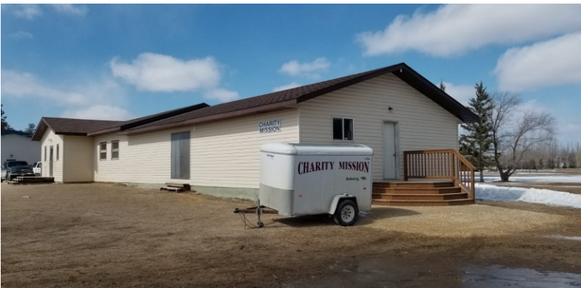
Charity Mission - Arborg, MB Collection, Sorting, Baling - Shipping to Winkler, MB

...When all cardboard sheets were picked up at the furniture stores and the baling Sheets were cut by hand.