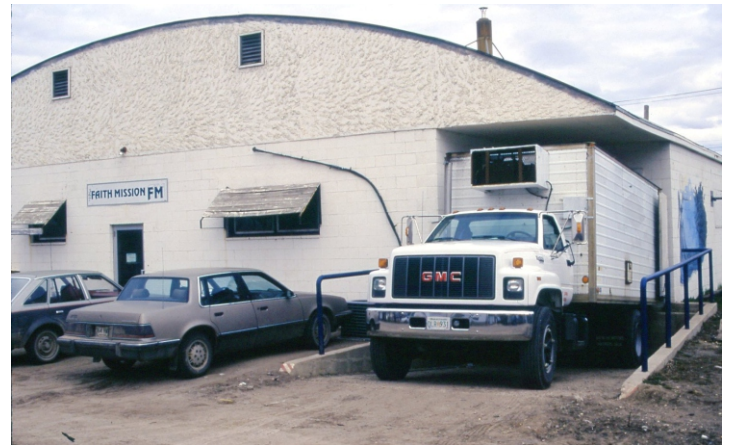
Move into Old Sewing Factory 2nd Street, Winkler, MB - 1994