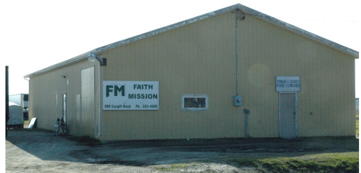
Move to 500 Cargill Road Winkler, MB - 1999