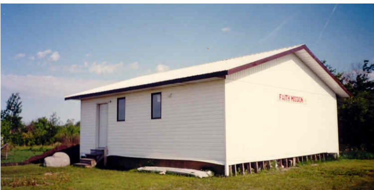
Drop-off & sorting near Grunthal MB