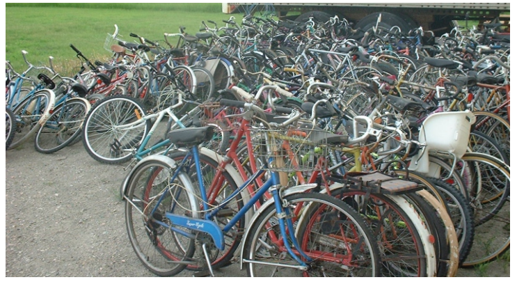
Photo Above: Bicycle storage in 1999 or 2000 Photo below: Bicycle Storage in fall of 2018