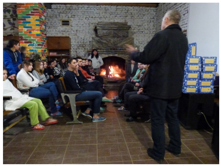
Sharing the wonderful news of Christmas with the youth visitors from war-torn Donetsk.

Our volunteers will also visit some more orphanages after the children come back from winter holidays. They will distribute clothing and gifts to those people. We recently met