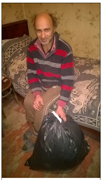
Georgian man, happy to receive a clothing package