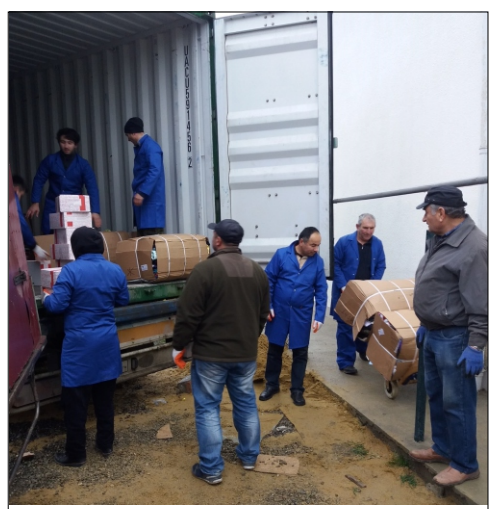
Unloading bales and Gift Boxes in Tbilisi, Georgia.

As we have often shared before, God's timing is not necessarily our timing... His Way is the Best!