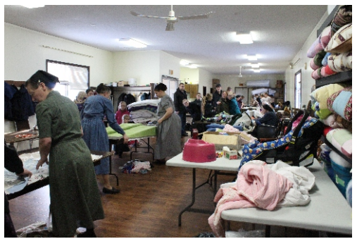
LaCrete ladies busy making blankets.

The tour started in Osler, SK where we enjoyed the warm hospitality of friends and an encouraging Sunday morning church service. January 28th was our first presentation with an attendance of about 125 people. It was encouraging to see how many people throughout our tour in one way or another are involved in the mission, some sew blankets, some donate clothes while others share in the work financially. Our next presentation was in the Musidora Old Colony Hall in Two Hills, AB. About 140 people were present. From there we went north to La Crete, AB. The scenery was breath taking; they had just gotten a beautiful blanket of snow. In La Crete we saw where the ladies sew many blankets for Faith Mission and we