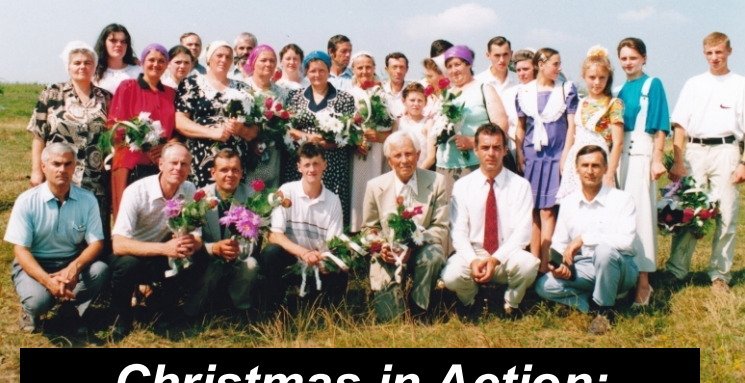
Christmas in Action: "Christmas Gifts for EVERY child"

.....the first Baptism Service in the Carpathians