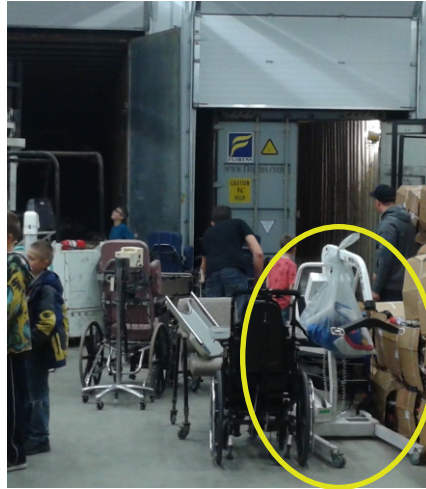
Medi-Lifter (circled in photo) and wheelchairs being loaded into shipping container Nov.17, 2016