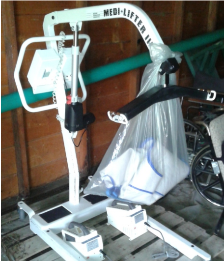
Medi-Lifter when we picked it up from Morden Tabor Home Shop