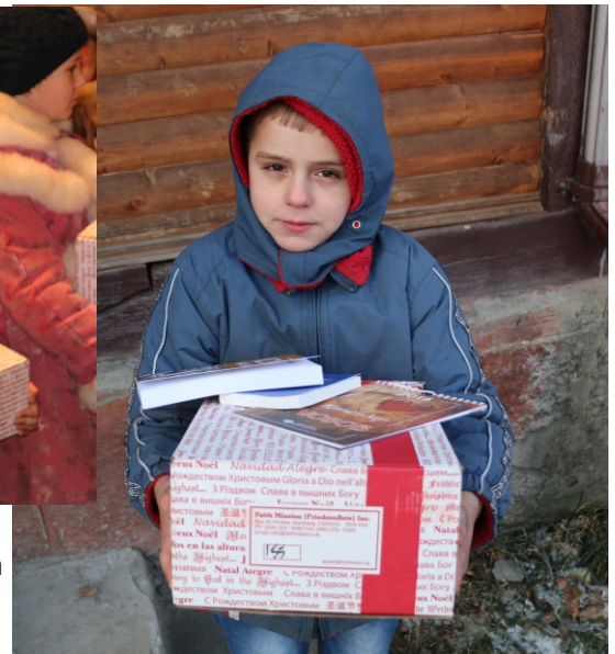
Gift boxes in top photo are ready to be loaded into the container in Winkler, Manitoba. Bottom photos were taken in Ukraine at various distribution locations this last Christmas.