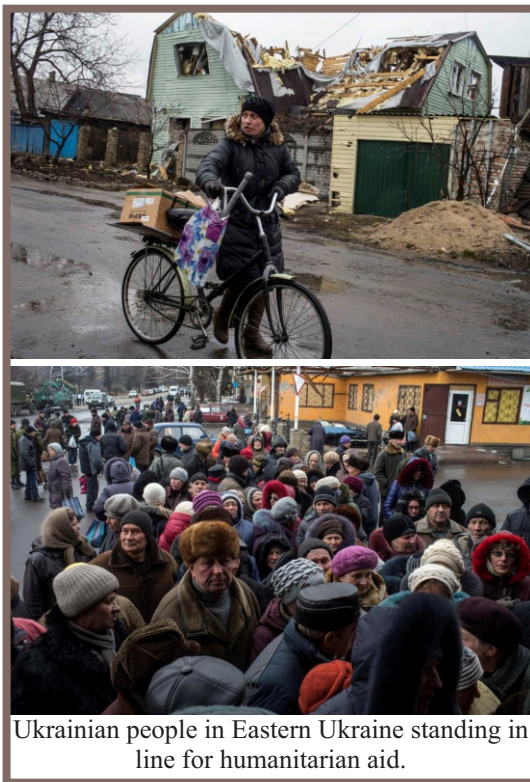
Ukrainian people in Eastern Ukraine standing in line for humanitarian aid.

This is how it is now...(Jan.19, 2016) .....Anatoliy