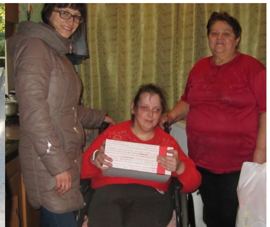
A person with a disability being blessed with a Faith Mission Christmas Gift Box