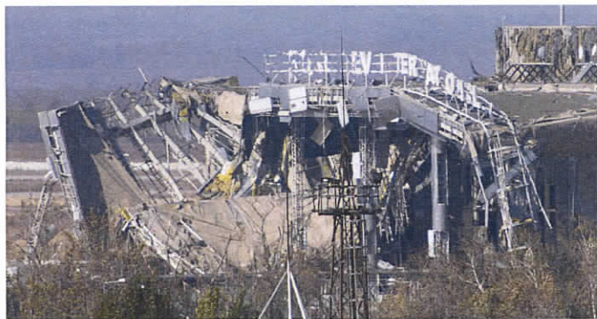
The same Donetsk Airport December 2014 totally destroyed. Recent reports have indicated that the Russian