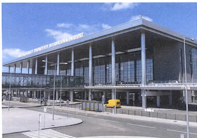
Donetsk Airport Terminal Spring 2014

separatists may plan to use this airport as their air force base. Please pray that God will intervene! We can not fathom the power of God’s love and we can not imagine how His Grace can be sufficient to forgive and forget all this bloodshed. Please also pray that Faith Mission’s path between Canada and Ukraine will remain open so that we can provide more clothing, footwear and other essential items to these needy people. ~ ~ ~