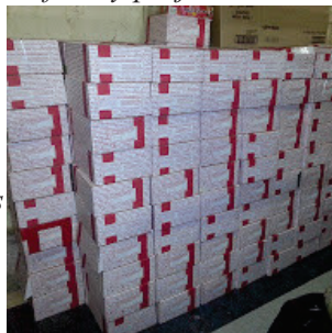
Filled Gift Boxes dropped off at Faith Mission-Winkler

A big thank you to all who took part this year, as we know by having read the stories in past newsletters there are many needs in Ukraine and filling a gift box is such a simple thing for us to do. We could say it's an overseas mission that we can participate in, right in the comfort of our own homes. We can make it a family project. We can go shopping together with our young children and at the same time explain the reason for the mission and teaching our children the importance and value of helping those less fortunate than ourselves. I had set a goal of 500 boxes for the Arborg Gift Box drive and we achieved 231. Thank you!