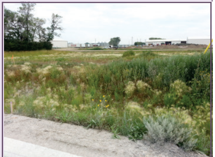
Here is our “new” place! 425 Roblin Blvd East . Right at the corner of Circle K Drive & Roblin Blvd East.

Our hope and prayer is that this new facility will make it easier for our volunteers to work with the sorting and baling and especially for the men who faithfully come to help with loading the containers. The loading dock will make that task so much easier. PTL! We do not know where the Lord will lead Faith Mission but it is exciting as we follow Him into the future!