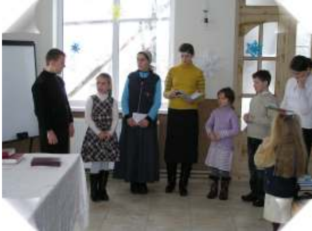
Putting the finishing touches on the Tuchapy Church. Just in time for the Christmas celebrations.