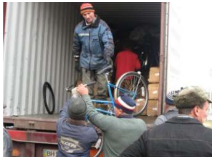
Above Photo: Unloading Bales & Bikes in Ukraine.