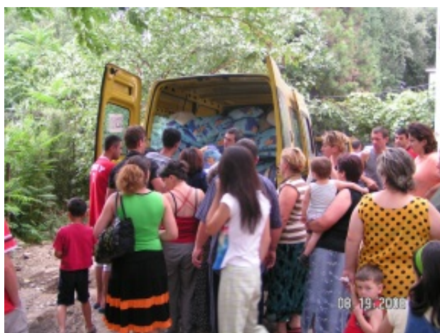
Our Christian friends in the Republic of Georgia count it a privilege to be able to distribute humanitarian aid after the recent Georgia \ Russia war