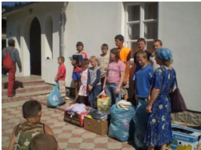
Humanitarian Aid from Germany and Canada being distributed on the church parking lot. Each family was also given a Bible.