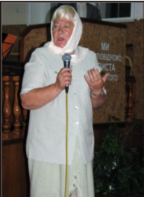
This school teacher lost everything in the flood. The Christians provided her with clothes and many other things. During the first church service she ever attended, she shared; not only about these precious gifts but also about a much greater gift she had received as a result of this. She was now included in the family of God! God had truly revealed His love to her

From the cash donations, the local Christian brothers bought potatoes, flour and sugar and distributed these supplies in remote villages where many inhabitants had lost everything. With impromptu services outdoors, or during the scheduled church services,