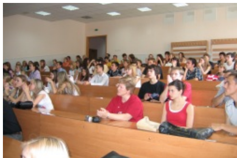
Students at the English Language Institute in Kharkov, Ukraine

Manitoba, to teach a three week English course to Ukrainian students. The students are mostly college age with English levels ranging from beginner to advanced. The teachers are predominantly from Manitoba. Teachers presently use the facilities of Kharkov National Economic University in the centre of Kharkov. With 1.6 million people, Kharkov is