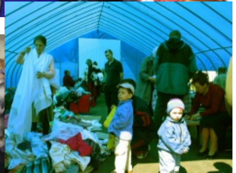
Clothing & Footwear - Kharkov, Ukraine