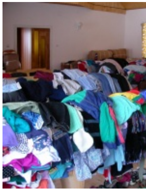
Clothing, footwear and many Bikes - Carpathian Village of Steiche, Ukraine