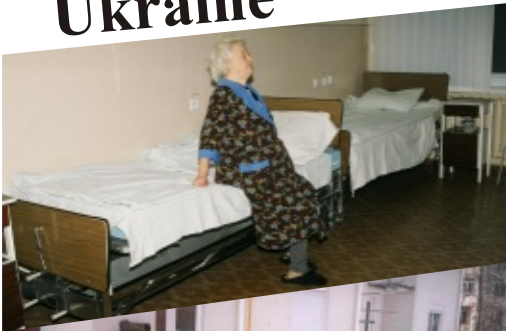
Chainsaws, Two-Wheel Carts, Hospital Beds, Clothing & Shoes, Khmelnitzky, Ukraine