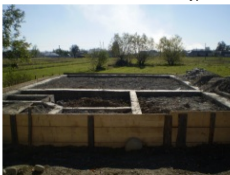
New Church foundation in the Carpathian village of Tuchapy

not a large sanctuary, it will be much more spacious than where they are meeting now. The church sanctuary will be on the ground floor and the second floor will be home for a young, childless, Christian couple who are hoping to provide a home for 3 - 4 orphans. Every inch of space in this new building will be utilized.