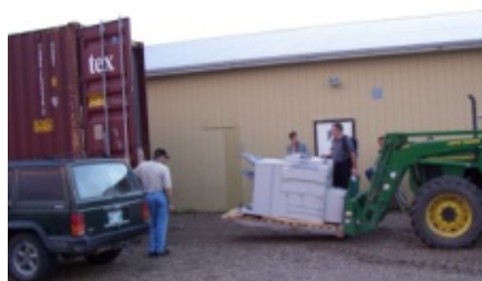
"Huge" photocopier being loaded into Container in Winkler MB, to be shipped to Kharkov, Ukraine

The English Language Institute Ukraine 2008 is pleased to work with Faith Mission to serve the Lord in Kharkov, Ukraine.